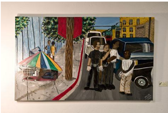
Art Detail - Darlene Altemeir Dobbs "1/2 telephone pole, 1/2 dyptic"